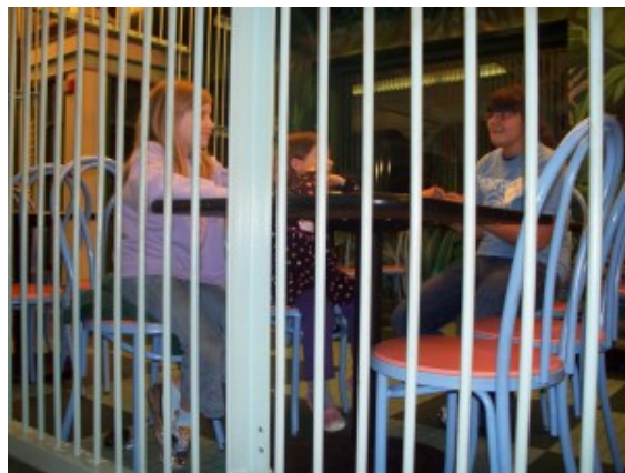
the kids eating in an animal cage at the Carnivore Cafe

Next we went to the Carnivore Cafe (used to be an exhibit building that housed animals and they left some of the cages up for kids to eat in – they get a big kick out of this) for our snack of pizza, raisins, juice, and animal cookies.