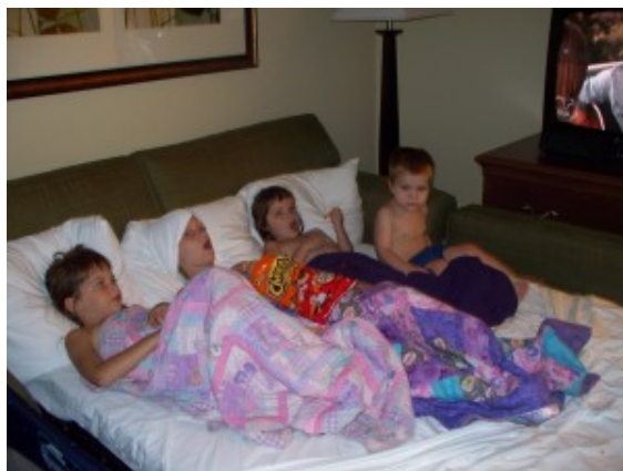
4 party animals in the hotel

probably making us look like total hicks. But that's ok, we had fun! And not only do I love living in a rural area because we have no crime, crowds, or traffic, but it makes things like visiting malls or big movie theaters rare treats and fun vacations!